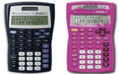
Middle School Math Courses, CC Algebra 1 & CC Geometry: